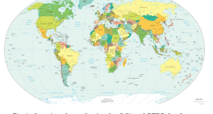
Fig. 1. Locations for evaluating feasibility of OTEC development in islands of the U.S. - Puerto Rico and St. Croix in the Caribbean, and Hawaii and Guam in the Pacific Ocean.

The major environmental effects of concern for OTEC are the return of the large amounts of cold deep seawater brought up for heat exchange with warmer surface waters.