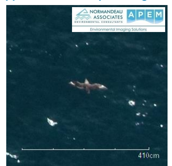
South Polar Skua