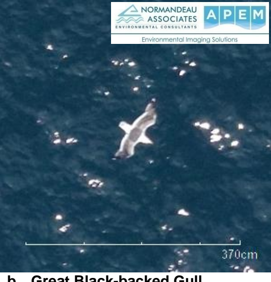
Great Black-backed Gull