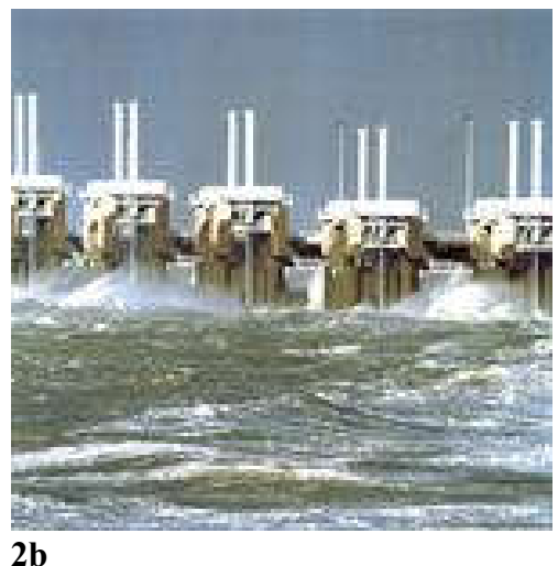
Fig. 2 . (a) Topview of the Eastern Scheldt Storm Surge Barrier, showing the two artificial islands and the three sections (Hammen, Schaar and Roompot), during flood tide. (b) A diagonal view of the Roompot section of the surge barrier from the North Sea side during extreme high tide, showing the concrete pillars and the metal tube protections of the gates. The metal vertically sliding gates are down.

Page 6 of 21 Potential effect storm barrier and turbines on porpoise and seal movements