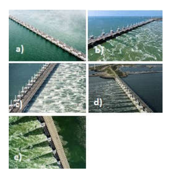
Fig 3. The Eastern Scheldt Storm Surge Barrier, showing water currents during the tidal cycle. The North Sea is to the left in all photos. (a) Slack tide (no current, no turbulence); (b) flood tide (weak current and turbulence on the Eastern Scheldt side); (c) flood tide (strong current and turbulence on the Eastern Scheldt side); (d) Ebb tide (weak current and turbulence on the North Sea side); and (e) ebb tide (strong current and turbulence on the North Sea side). (Source: Rijkswaterstaat Beeldbank).