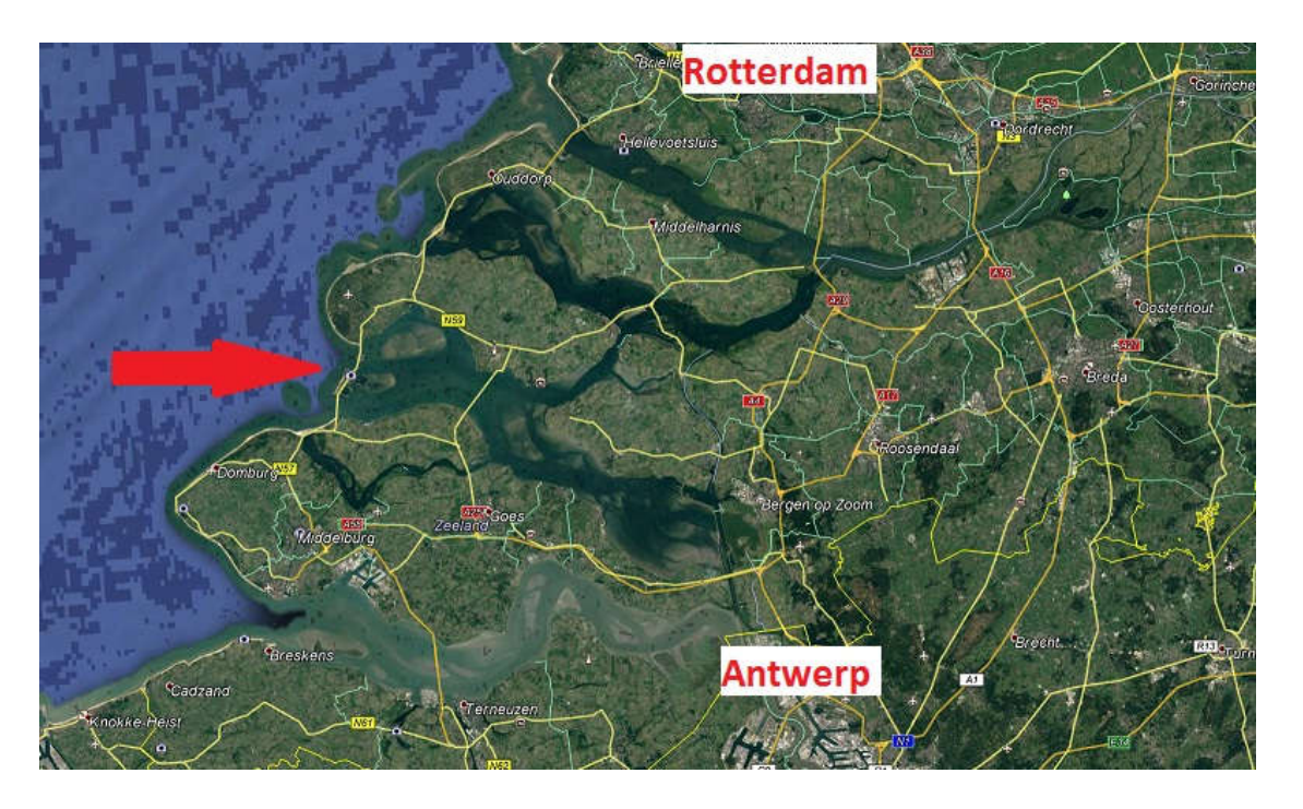
Fig. 1. The Rhine and Scheldt delta area in the south-west of the Netherlands. The Scheldt flows through Antwerp, Belgium, in the south; the Rhine delta from the north-east of this map. The Eastern Scheldt storm surge barrier (indicated by the red arrow) separates the Eastern Scheldt from the North Sea.

The Eastern Scheldt Storm Surge Barrier is the largest of the Delta Works, a series of dams and barriers with gates that can be closed designed to protect the south-western part of the Netherlands from flooding. Instead of separating the Eastern Scheldt from the North Sea with a dam, a storm surge barrier was built that is only closed under extreme tide and storm surge conditions, so that the marine environment in the Eastern Scheldt is protected. The Eastern Scheldt, a former estuary, has always been a dynamic area with frequent changes in the shape and depth of waterbodies ( Fig. 1 ). In and around the Eastern Scheldt there are ~140 species of water plants and algae, ~70 species of fish, ~350 species of other aquatic animals (https://www.clo.nl/indicatoren/nl1598-fauna-oosterschelde). The Eastern Scheldt is an important area for feeding, breeding, and overwintering birds; since 2002, it has been designated as a National Park, an EU Natura 2000, and a Ramsar Wetland site. The nearby Voordelta in the North Sea is also an EU Natura 2000 site and a Ramsar Wetland site. If the Eastern Scheldt had been closed with a dam, this rich saltwater environment would have been lost, together with the mussel and oyster culture, which would have had severe economic consequences for the regional fishing industry. The barrier was completed in 1986.