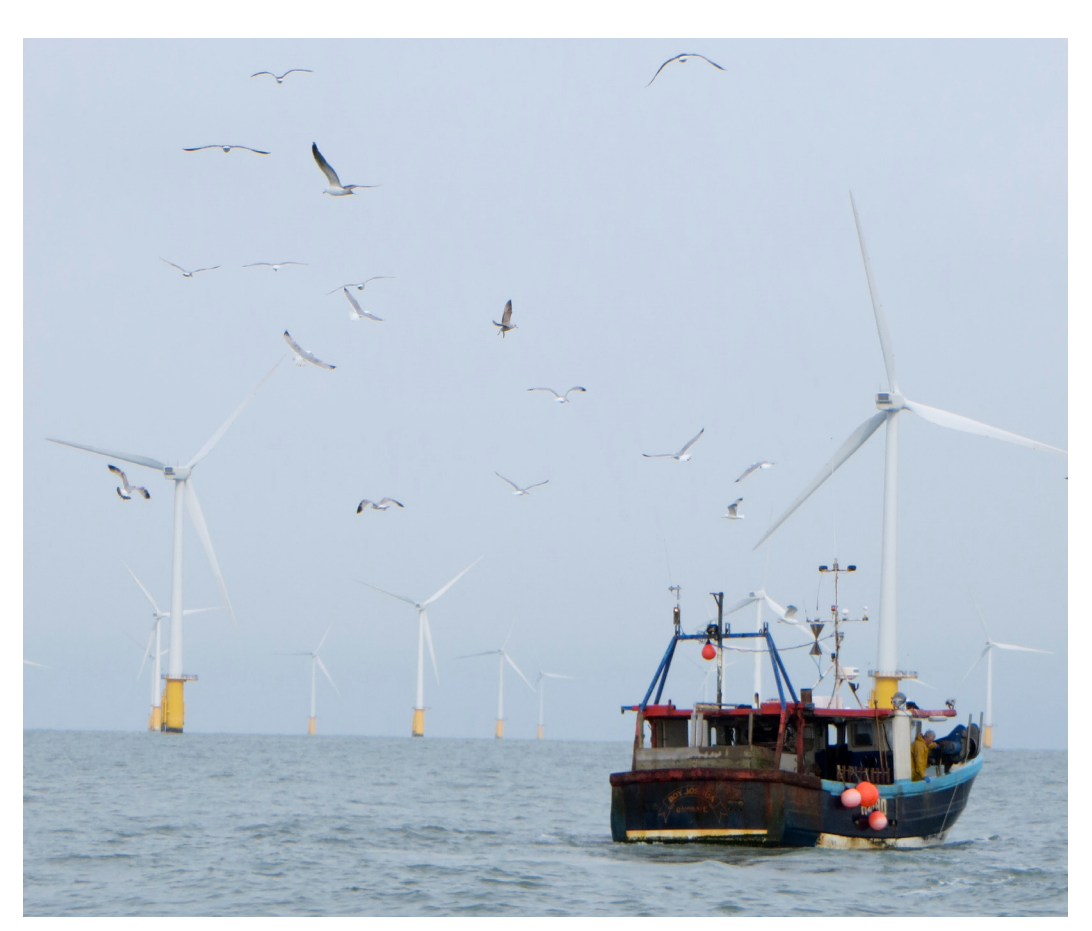
Gillnetter in Thanet Offshore Wind Farm

ies when data collection at this level is not possible. Manderson described a spatial model of winter habitat for Atlantic mackerel, based on data from the fishing industry, in which mackerel presence is associated with water temperature. He said that although temperature is not the only determinant of mackerel habitat, focusing on a dominant parameter is useful for creating models at large scales. He was able to see that mackerel migrate from the North Atlantic to the Mid-Atlantic Bight to overwinter, so there is a need for connectivity between these regions. This spatial model can be overlain with expected wind farm areas and other management closures to identify how much mackerel habitat may be restricted in the future. Due to annual variations in water temperature, suitable winter habitat for mackerel varies annually and, on average, has