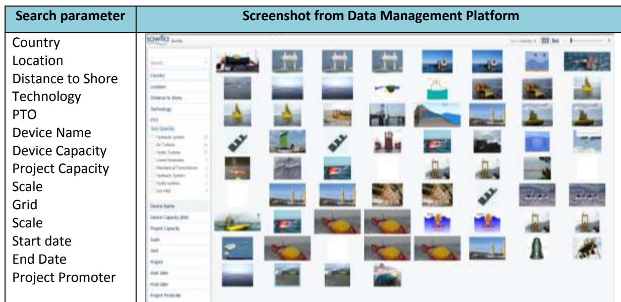
Figure 3: Provisional image from the SOWFIA Data Management Platform (http://sowfia.hidromod.com/)

The ultimate goal of these activities is to facilitate faster, more effective, development of wave energy sites in the future by ensuring that data collected as part of EIA activities address the appropriate questions in the most efficient fashion possible. Using standardised or comparable methods for monitoring will also facilitate meta-analyses of datasets from multiple sites and will greatly increase our understanding of the factors affecting environmental impacts of wave energy developments on marine environments.