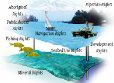
Figure 8.1. Representation of different potential marine users and conflicts of interest (Sutherland 2005).

M SP works across multiple sectors, within a speci-fied geographic context, to facilitate decisionmaking about the use of resources, development, conservation, and the management of activities in the marine environment both now and in the future. To be effective, MSP should be integrated across sectors, ecosystem-based, participatory, strategic, adaptive, and tailored to suit the needs of a predetermined marine area. Currently, marine activities tend to be managed on a sector by sector basis, thereby limiting the consideration that can be given to other marine activities likely to occur in the same space, as well as the effects of that activity on the receiving environment. Processes such as environmental assessments address the impacts of an activity on the environment before a development or activity occurs, but this can be limited to a specific site and cumulative impacts