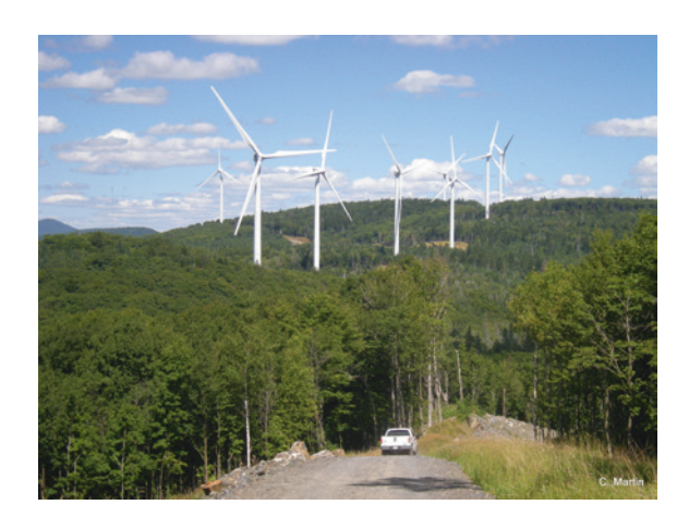
Fig. 11.3 Wind energy facilities on forested ridges in the eastern USA have consistently documented high fatality rates of bats

From 2000 to 2011 in the USA and Canada, annual bat fatality rates were highest at facilities located in the Northeastern Deciduous Forest (6.1–10.5 bats/MW; Fig. 11.3) and Midwestern Deciduous Forest-Agricultural (4.9–11.0 bats/MW) regions defined by Arnett and Baerwald (2013: 438). Average fatality rate in the