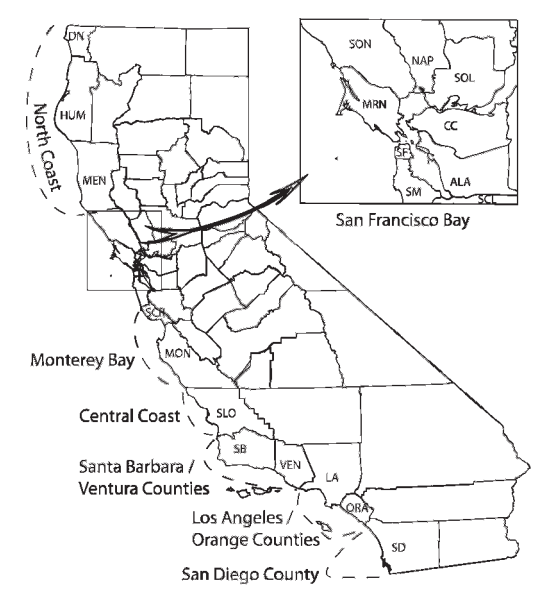
FIGURE 1. Map of defined geographic regions in coastal California. County abbreviations: ALA =Alameda, CC = Contra Costa, DN = Del Norte, HUM = Humboldt, LA = Los Angeles, MEN = Mendocino, MON = Monterey, MRN = Marin, NAP = Napa, ORA = Orange, SB = Santa Barbara, SCR = Santa Cruz, SD = San Diego, SF = San Francisco, SLO = San Luis Obispo, SM = San Mateo, SOL = Solano, SON = Sonoma, and VEN = Ventura.

Therefore, the objective of our study was to retrospectively evaluate the prevalence of injury due to fishing gear entanglement and ingestion in representative marine wildlife of the California coast: Brown Pelicans ( Pelecanus occiden talis ), gulls ( Larus spp. ), California sea lions ( Zalophus californianus ), northern elephant seals ( Mirounga angustirostris ), and Pacific harbor seals ( Phoca vitulina ) identified in rehabilitation facilities.