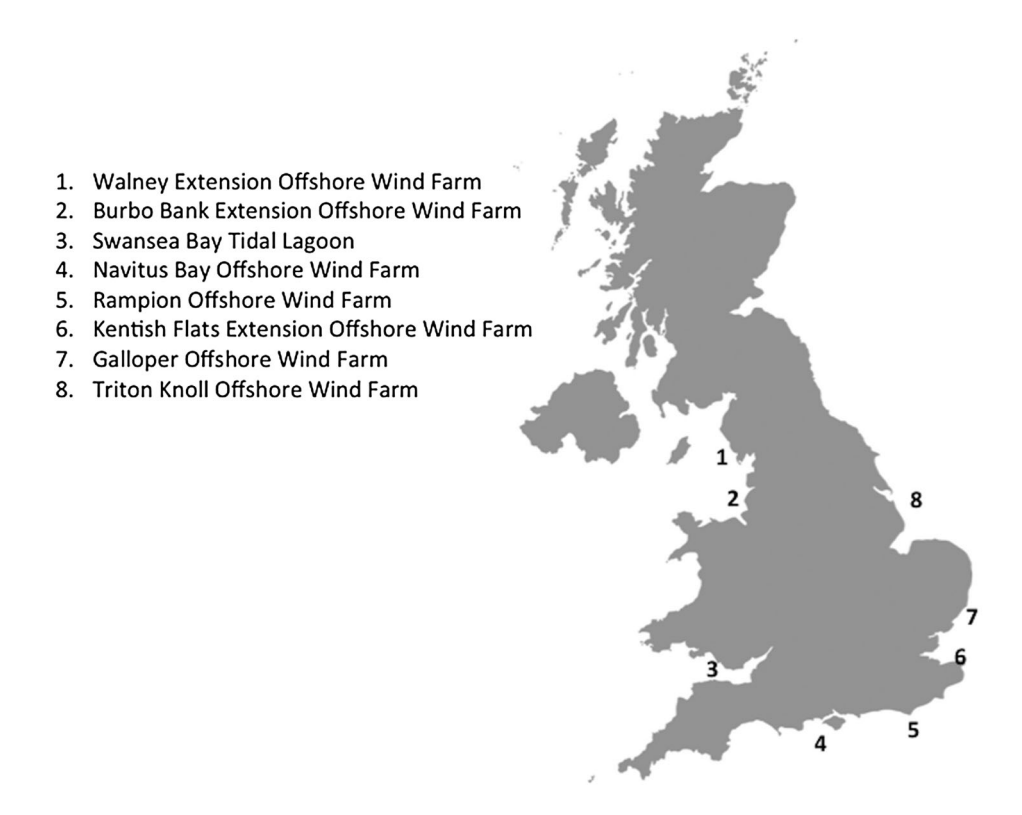
Figure 1. Case study locations.

piece of evidence has to be present in the report if it is to have any significance and the way it is expressed matters. Thus, the report becomes the central obligatory passage point within regulation, one through which all relevant material must pass, leaving its traces in the official record, if it is to exercise any agency. For these reasons, the ExA reports played a central part in our research methodology and subsequent analysis.