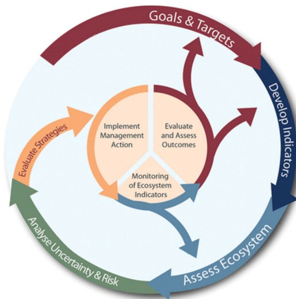
Figure 1. The cyclical, integrative nature of ecosystem-based monitoring and adaptive management. Adapted from the description of the NOAA Integrated Ecosystem Assessment process in Samhuri et al. (2014).

Ecosystem-based monitoring (EBM) can be used to monitor the biodiversity and functioning of an ecosystem, including changes that may occur as a result of offshore wind energy development (e.g., Ruckelshaus et al. 2008; Pezy et al. 2020). An EBM plan represents a combination of efforts to monitor specific taxa as well as the broader environment and is organized as a nested hierarchy, comprising habitat zones encompassing communities of species at the broadest level down to specific individuals within a population at the most focused level. Ecosystem-based principles, such as those used in a monitoring plan, are inherently system focused--as the name implies. They represent a holistic view of a given ecosystem, and provide a framework that can be used to assess the health of an environment across all levels. This hierarchical framework provides a guide to determining the types of monitoring required to observe the ecological conditions in a specific region. The goal of an EBM plan being to build a monitoring framework that effectively aids and informs decision making with an allowable degree of uncertainty.