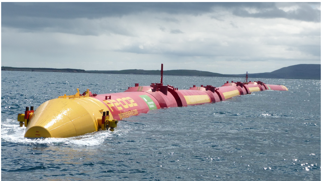
Figure 1: SPRs Pelamis P2 Wave Energy Converter under test in Orkney

The Pelamis device has undergone rigorous design validation in the intervening years. With more than 2,000 hours of operation, the prototype machine successfully demonstrated the Pelamis concept at full-scale, as well as generating continuous power into the grid, as expected and predicted by simulation models of experienced sea states and imposed control settings.